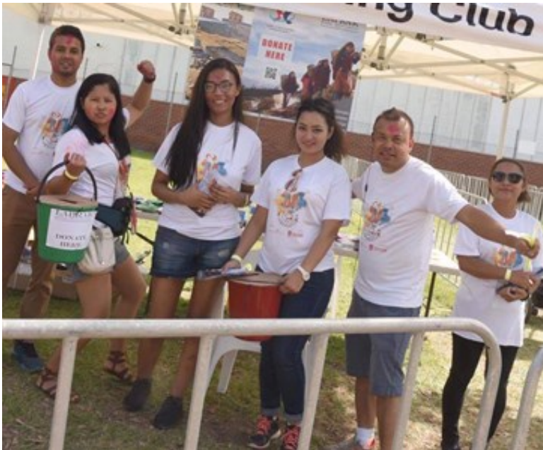
Volunteers ready with their collection tins—gold coins please

A number of MIT members volunteered on the day to assist in collections and Momo making—a great big thank you to those who have made such a big effort. Without the help of volunteers such as these devoted people, this charitable work could not be done.