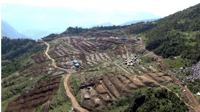
(Aerial View of the Site

What we did learn from this project is that we could not have done anything without consultation, assistance from others and sharing of knowledge. We know that the people who need these homes all need to maintain their dignity and we must not make them feel less than they are. We must also be aware that the housing placements must be equitable and that the people chosen to live in the homes must fit the criteria set. The government of Nepal set out guidelines and these are to be followed but most importantly we need to be proud of what we have and can achieve by working together.