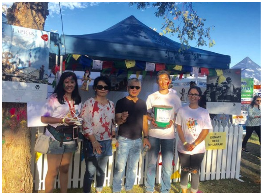
At the marquee—all sold out!